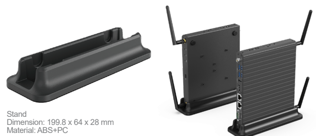
Stand Dimension: 199.8 x 64 x 28 mm Material: ABS+PC

Panel PC Tablet PC Industrial Computer COM Express Board Pico-ITX Board 3.5" Board EPIC Board Mini-ITX Board Micro-ATX Board ATX Board