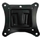
Vesa Mount (Optional)